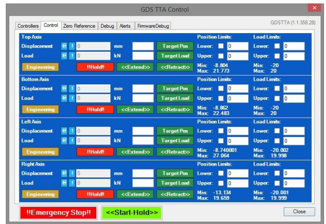
Fig 4. Control tab within the GDSTTA Control form.